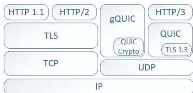
Fig. 1 Positioning of HTTP, gQUIC and QUIC

alter the real length of a packet, active research in the field has shown that defeating traffic analysis in QUIC is quite challenging.